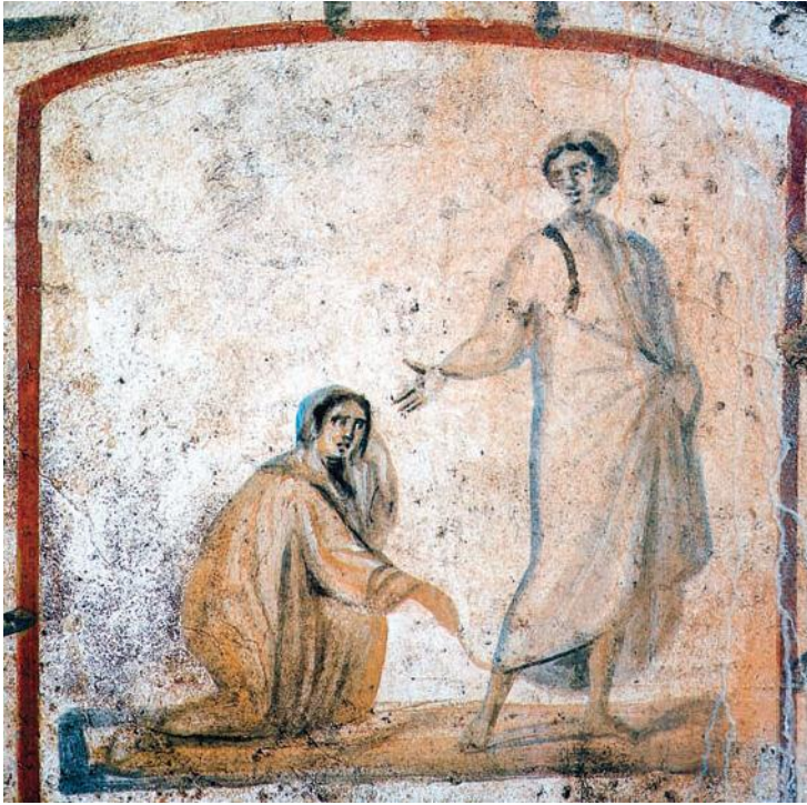
Christ and the Haemorrhoid wall painting in the catacomb of SS Peter and Marcellinus third century.